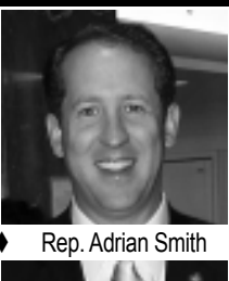
Rep. Adrian Smith