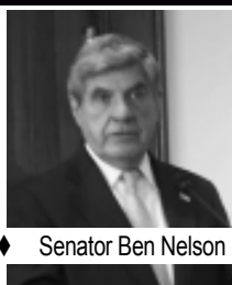
Senator Ben Nelson