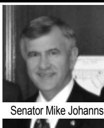
Senator Mike Johanns