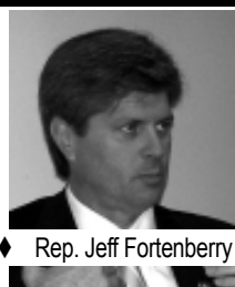
Rep. Jeff Fortenberry