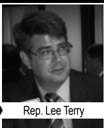
Rep. Lee Terry